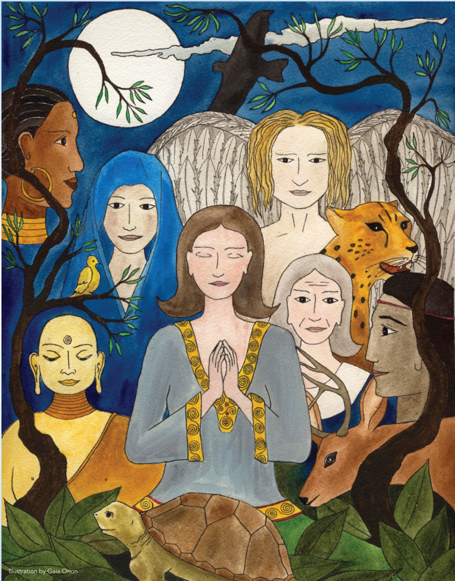
Illustration by Gaia Orion