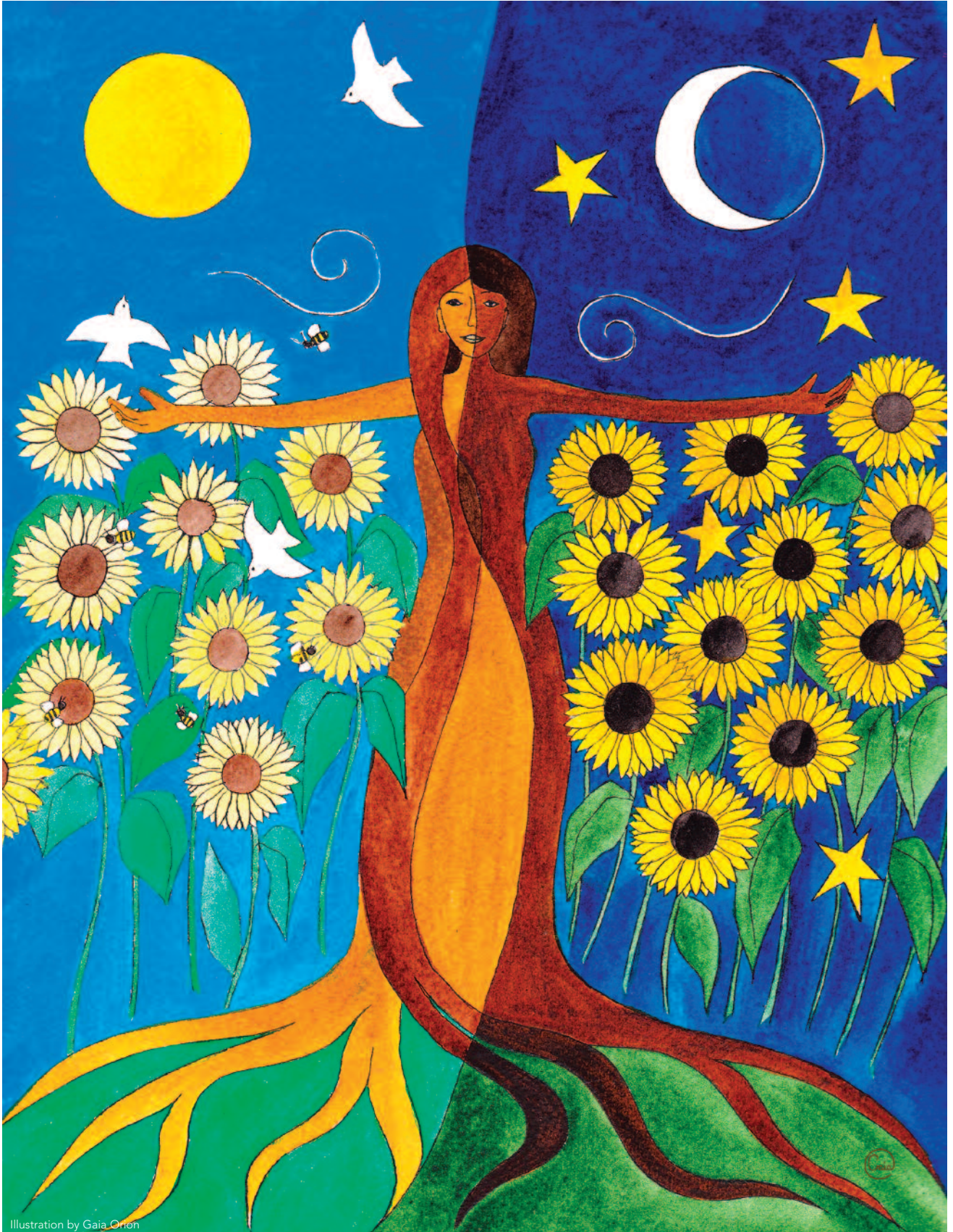
Illustration by Gaia Orton