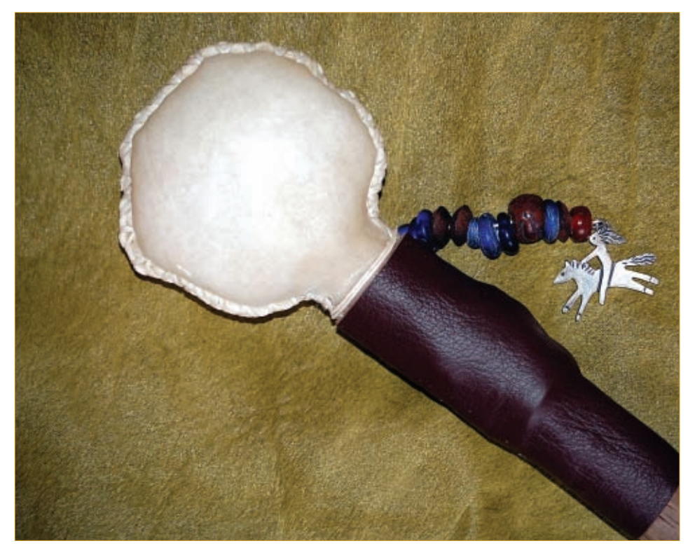
Reiki rattle used in meditation for prosperity.

remember our connection to the prosperous Universe. I use a Reiki Rattle, but the meditation can be done without one.<sup>2</sup>