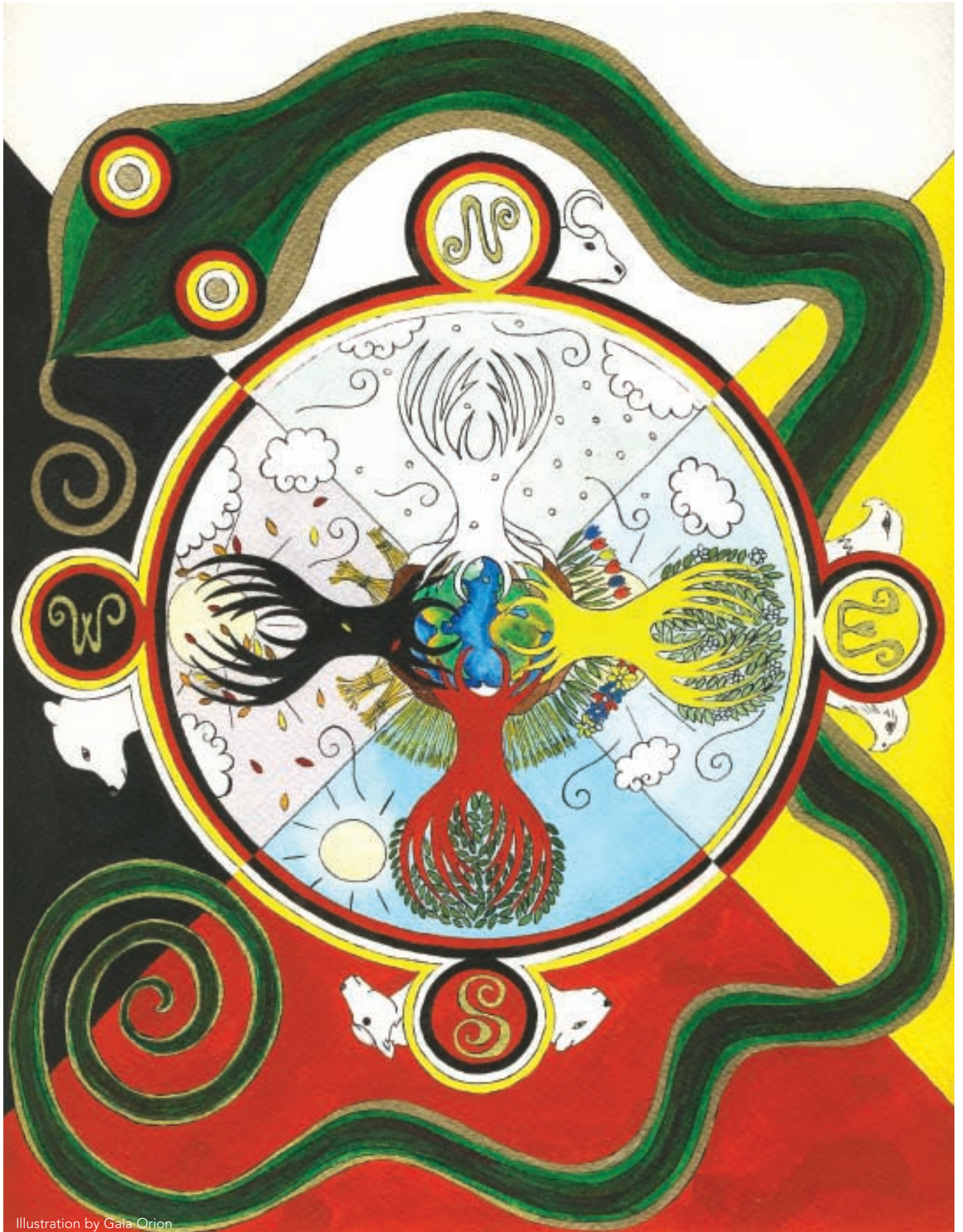
Illustration by Gaia Orion