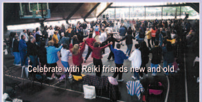
Celebrate with Reiki friends new and old

Stewart/Newburgh, NY airport (SWF), 1 hr. Albany airport (ALB) 2 hrs, New York City 2 hrs., Boston 5 hrs., Philadelphia 4 hrs., Toronto & Ottawa 8 hrs., Cleveland 8 1/2 hrs. The area is accessible by train and bus