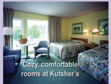
Cozy, comfortable rooms at Kutsher's

Note: Some photos are from past retreats