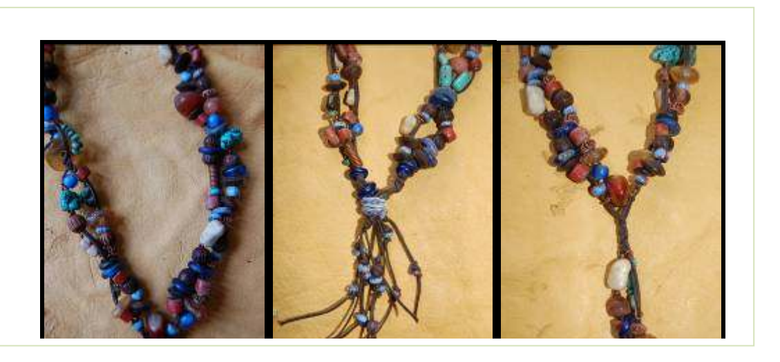
More photos of the bead combinations and style I used. Choose the beads and string them together in the way that calls to you.