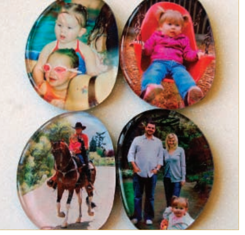
Refrigerator magnets of family always warm the heart!