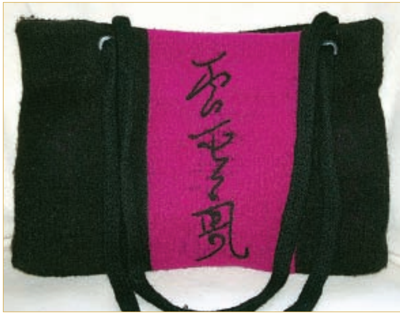
This Reiki Tote Bag has the Reiki symbols felted on the inside to hold your important treasures.