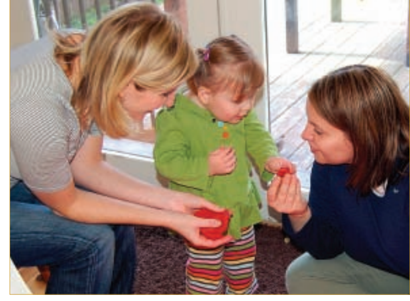
Reiki-Doh. Reiki-Doh has a completely different feel than traditional Play-Doh and is wonderful to play with. We had so much fun; it was a great day! Here is the recipe for Reiki-Doh.

Each of the crafters in this article imbues their projects with Reiki. Reiki adds another dimension and feel to each item or gift. Reiki enhances your ability to create and to enjoy your creations. It also continues to broadcast and emanate from your piece once it is made. I encourage you to use Reiki in all of your creativity, in any form. Plan Reiki craft dates with friends and family, make gifts for others, make things for your home.