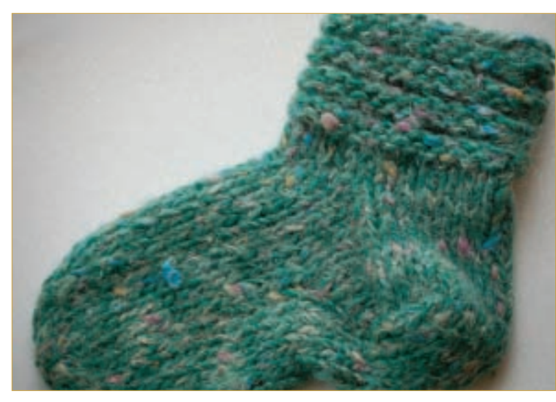
Slippers knit with Reiki feel like love and comfort hugging your feet!

The following are some additional examples of gifts you can make for others that are simple, inexpensive, and perfect for the upcoming holidays.