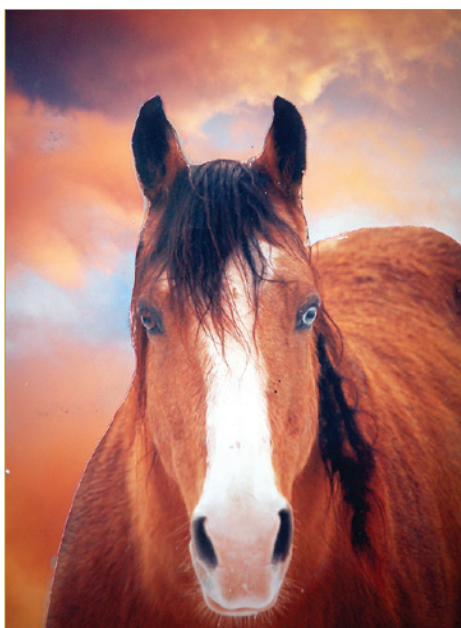
Dakota said, "I was born for you."

One day I asked Dakota to explain why he went lame. He responded, "I was born for you. I went lame to deliver you to your power to heal." He showed me images of my hands on him, and I knew it was Reiki. However, I procrastinated, putting Reiki training on the back burner. Then, about eight months later, a psychic randomly came into my business saying that she had a message from my horse. "Your horse said that he has