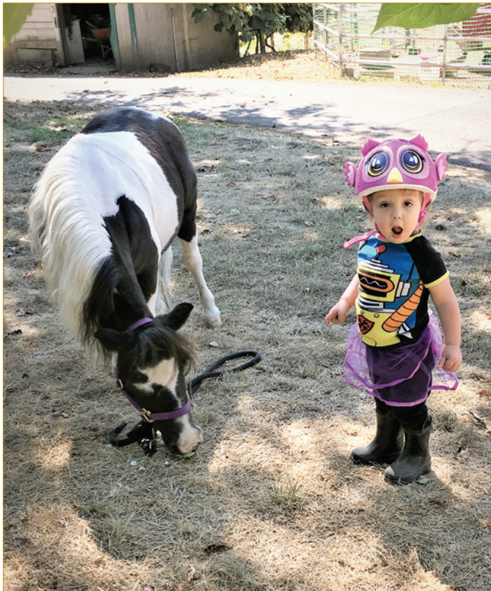
Gator and Luna.

Stella liked to work with my clients and in my Reiki classes. However, Daisy is most interested in taking care of her family. Daisy's message is about consent; animals need to choose how and when they want to provide Reiki as a service. Reiki's energy helps her, so she does not get depleted by her caregiving.