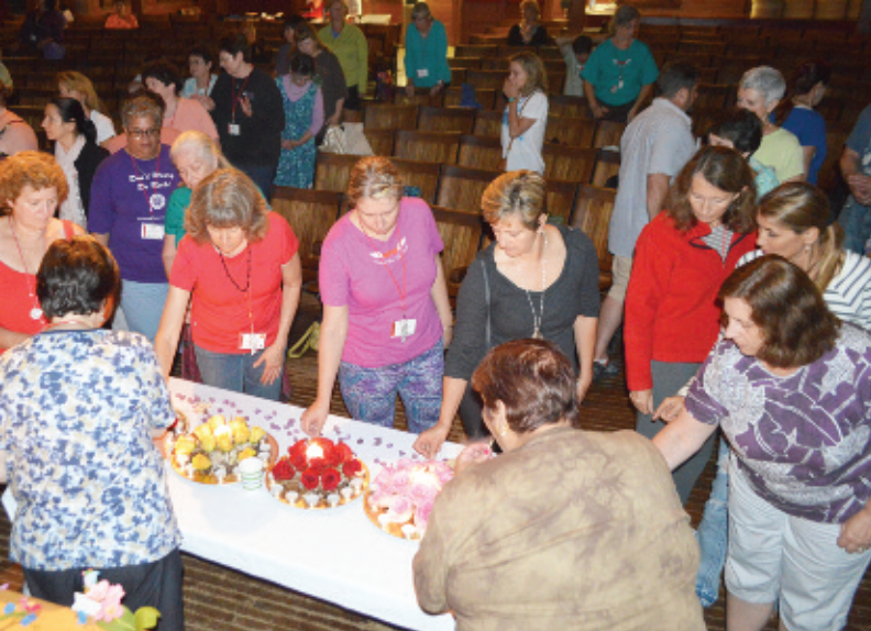
Left: Reiki Gratitude Ceremony, New York Reiki Retreat.